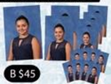
(1) 8x10, (2) 5x7's, (4) 3x5's & (8) Wallets